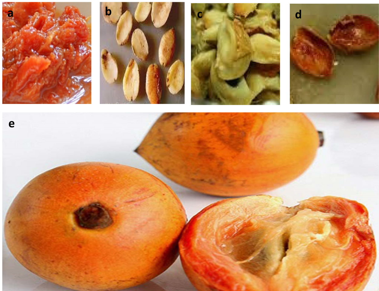
Fig. 1 African star apple fruit parts (a) Pulp (b) cotyledon (c) Seed coat (d) Pulp coat (e) Fruit

freeze-dried and placed in the refrigeration for subsequent analysis [21]. The fruits parts yield were 152.1 g dry sample/1000 g fresh fruit pulp, 126.5 g dry sample/1000 g fresh fruit cotyledon, 67.5 g dry sample/1000 g fresh fruit seed coat and 101.9 g dry sample/1000 g fresh fruit pulp coat for pulp, cotyledon, seed coat and pulp coat respectively. The freeze-dried fruit extract was then refrigerated at -10^{\circ}\text{C} and reconstituted for additional analysis.