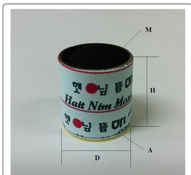
Figure 2 Moxibustion device. A photograph of the moxibustion device that will be used in this trial. This moxibustion device is a sticker-type disposable moxa, which functions for 5–10 minutes and is used for local acupuncture points. M: the upper part of the carbonised mugwort, A: adhesive sticker, H: height (2.1 cm), D: diameter (1.9 cm).

In the moxibustion group, 3 moxibustion sessions per week will be performed during a 4-week period for a total of 12 sessions. The treatment will be conducted after sterilising the skin surface at the acupuncture points with the participant lying in a supine position at a room temperature of 22°C to 28°C. After the top of the moxibustion is sufficiently combusted without attachment to the points for approximately 5 to 10 seconds, the moxibustion will be attached at each point. When a participant believes that their heat tolerance has reached its maximum, the practitioners will place a new moxibustion at the same point. However, to prevent burns, the attached point can be changed to within a 1 cm diameter according to the discretion of the practitioners. A total of 3 moxibustions will be attached at each point at every visit. We will use smokeless indirect moxibustions made of mugwort with a paper cylinder (Manina, Haitnim Co., Korea) (Figure 2). This moxibustion has an adhesive on the bottom that can be used to attach it to the skin, and its effect lasts approximately 5 to 10 minutes. The expected total time of each treatment session will be 20 to 30 minutes. The treatment points were selected in a consensus process by professors and researchers who have an acupuncture and moxibustion specialist license in Korea based on a text book [24], literature reviews [12,14,25],