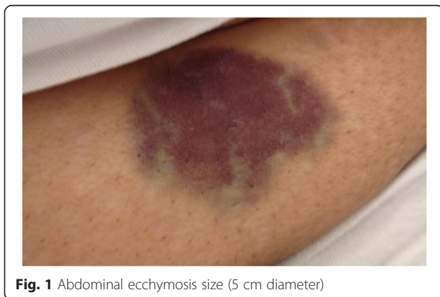
Fig. 1 Abdominal ecchymosis size (5 cm diameter)

Her peripheral blood smear showed: WBC; few activated lymphocyte and neutrophils with left shift, RBC; normocytic and normochromic, Platelets; giant platelets seen. Disseminated intravascular coagulation was ruled out based on laboratory test and blood film. She was assessed by a consultant hematologist and a diagnosis of